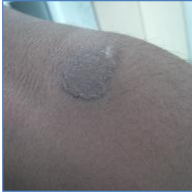
Image 3: Classical skin lesion with a grooved edge